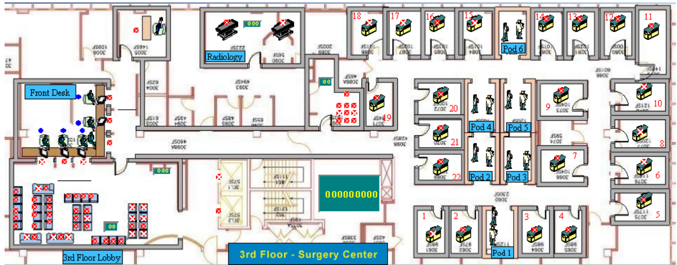
A diagram of the 3rd floor of the surgical division modeled in MedModel.

A four-Physician Sub Model was used to obtain a detailed visualization of process flow, room holding patterns and patient waiting count.