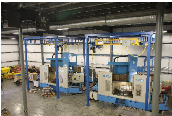
New Facility Layout: Opening up space in the new facility allowed the team to place machines closer together to reduce lag time without creating potential bottlenecks

The ProModel solution enabled the Flanagan team to design a seamless layout strategy that maintained customer delivery during a complex transition to a new facility and allowed them to maximize productivity post transition. Going forward the Flanagan team will use this technology as the basis for future capacity studies to determine the impact that new production orders would have on resource utilization and delivery dates.