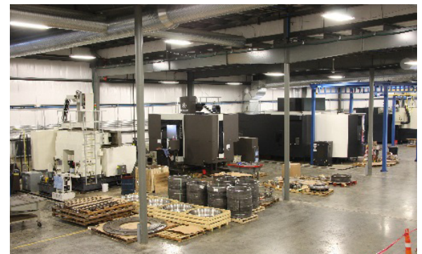
Metal cutting machine placement in new facility

After creating a second model scenario the team learned that layout and throughput could be significantly improved by segregating machines by size instead of by type and leaving some of the older machines at the original facility. This allowed the team to place the machines closer together at the new facility in order to reduce unnecessary lag time but without creating a bottleneck through restricted forklift and maintenance access. The team also learned that slight increases in inspection personnel and re-routing some parts to underutilized machines would improve throughput even more.